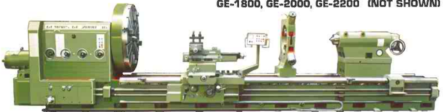
GE-1800-3G, GE-2000-3G, GE-2200-3G