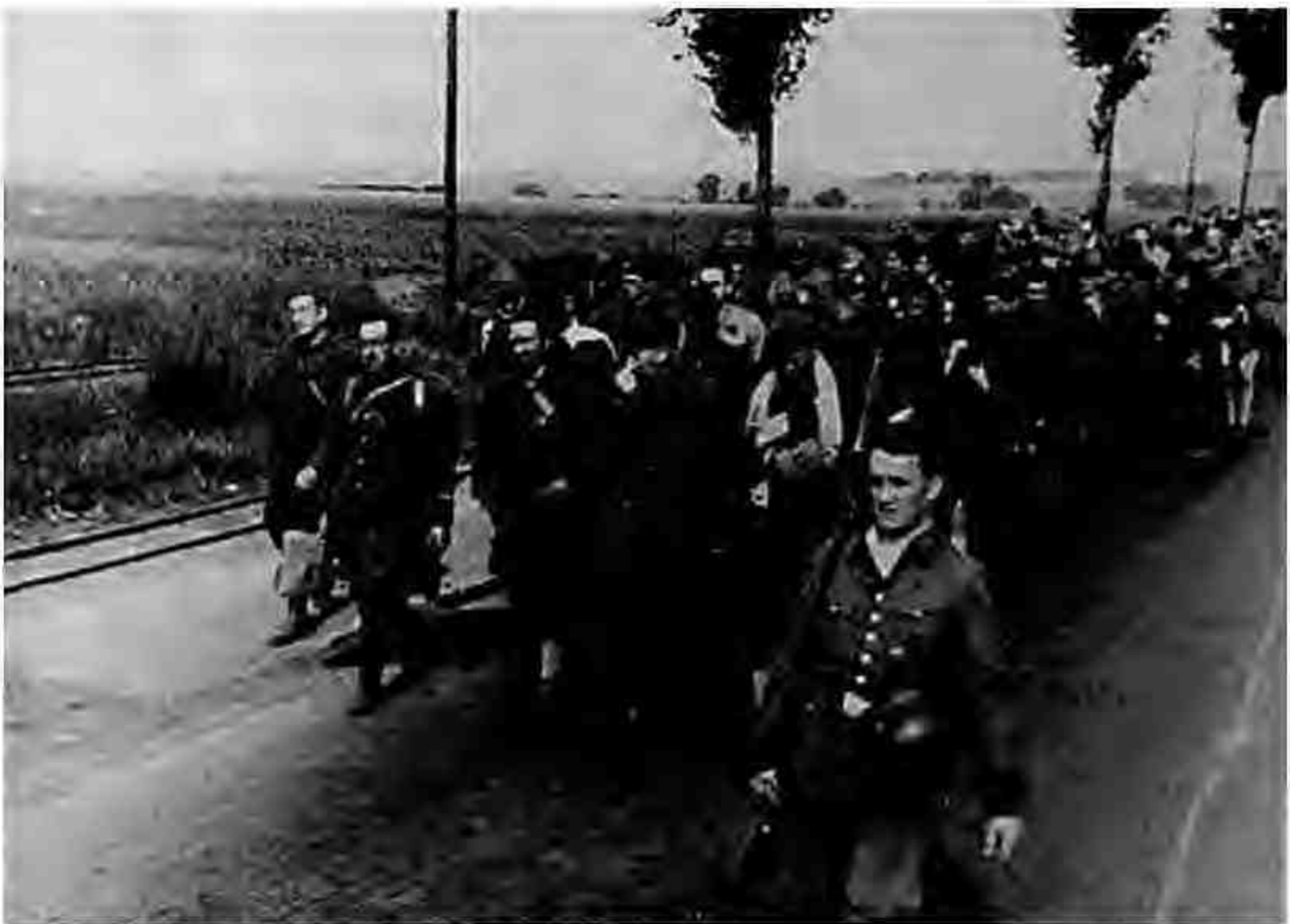
French prisoners-of-war, June 1940. Most were disarmed and sent home by the Germans after France surrendered.

General von Kuchler as leader of the Eighteenth Army;