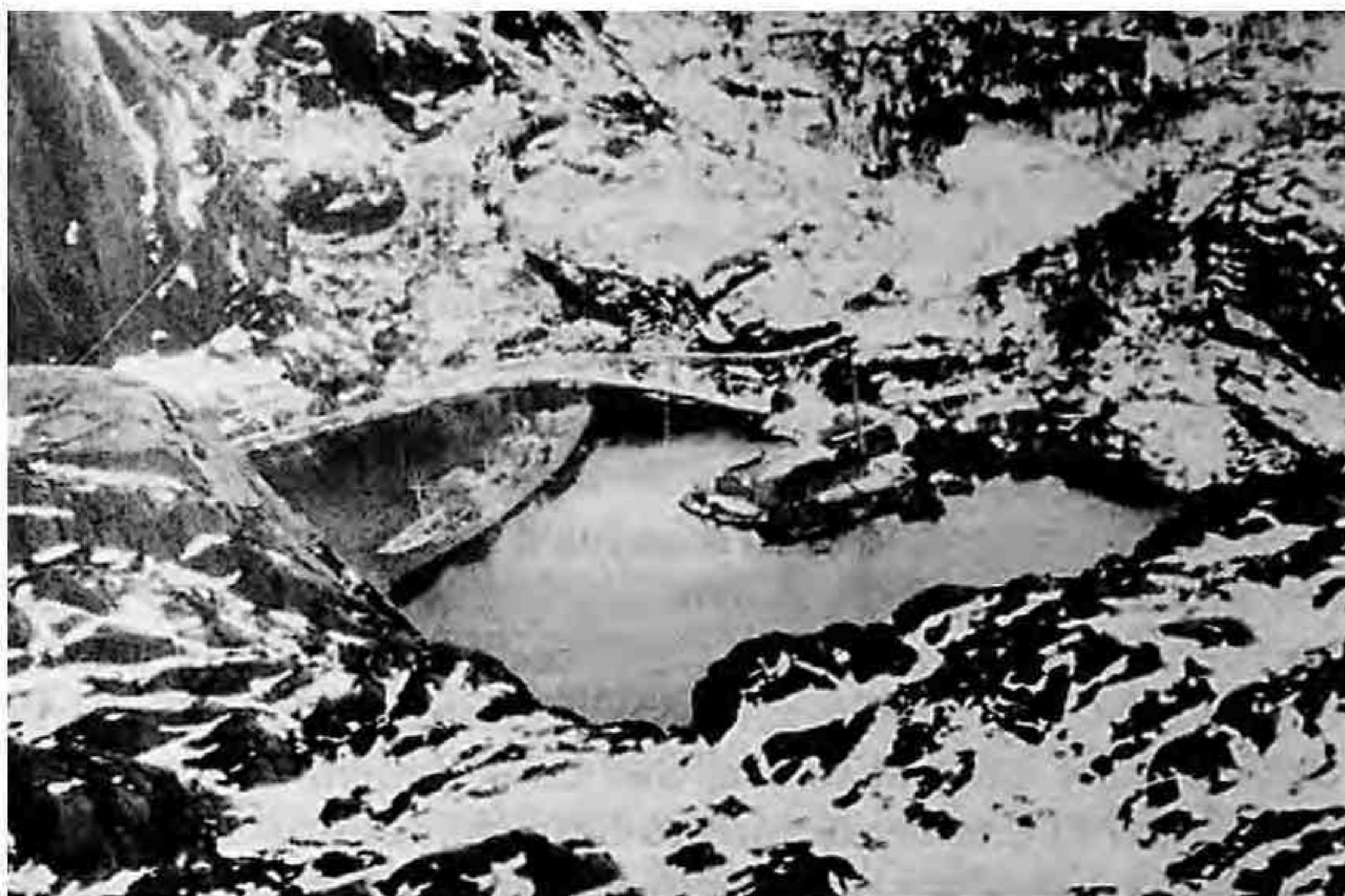
A British aerial reconnaissance photograph of the Altmark in Norway's Jøssingfjord.