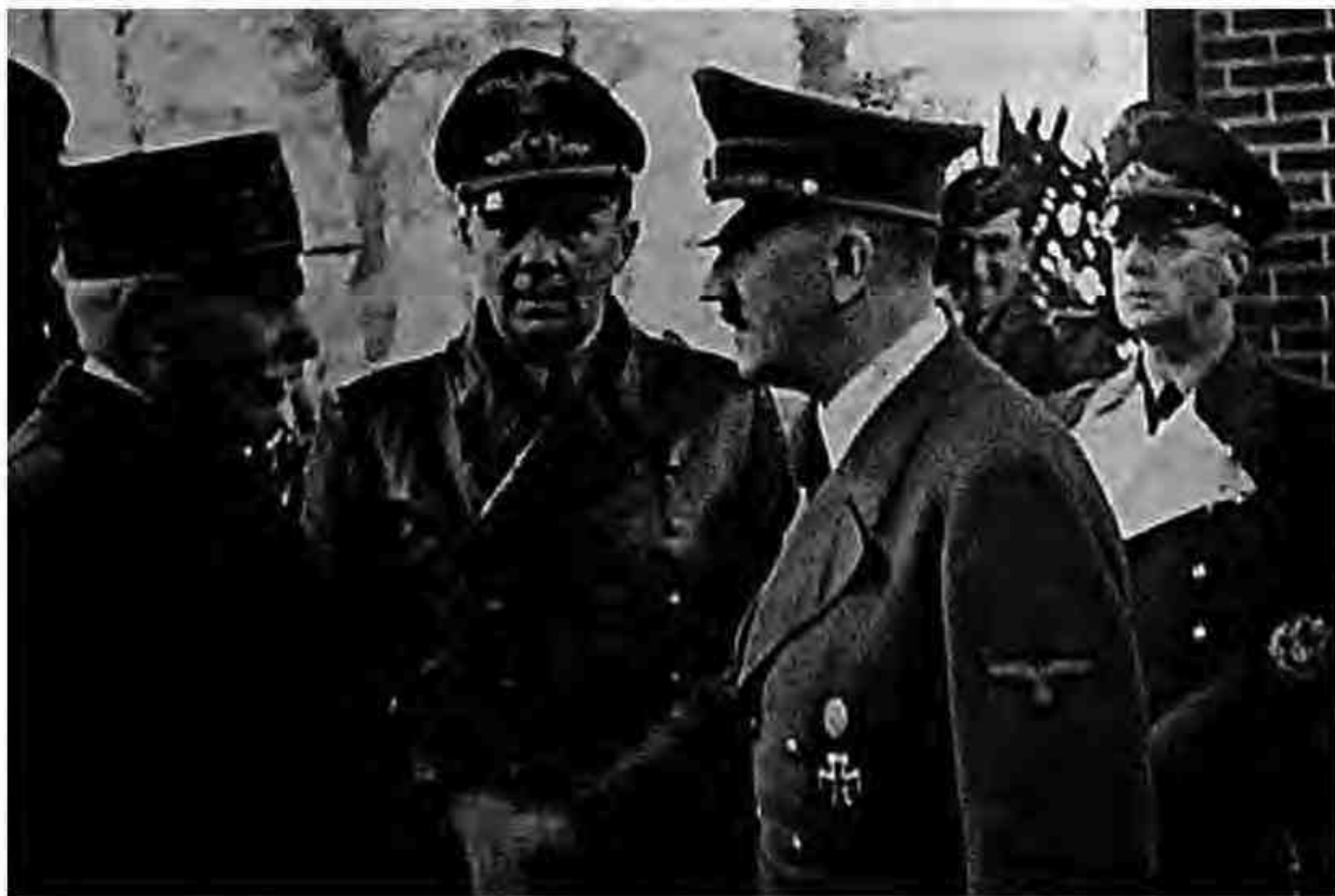
French President Marshal Pétain meets Adolf Hitler at Montoire. Foreign Minister Joachim von Ribbentrop at the right, October 24, 1940.

Indeed it was possible to get the German armies and their offensive actions going at several locations only after