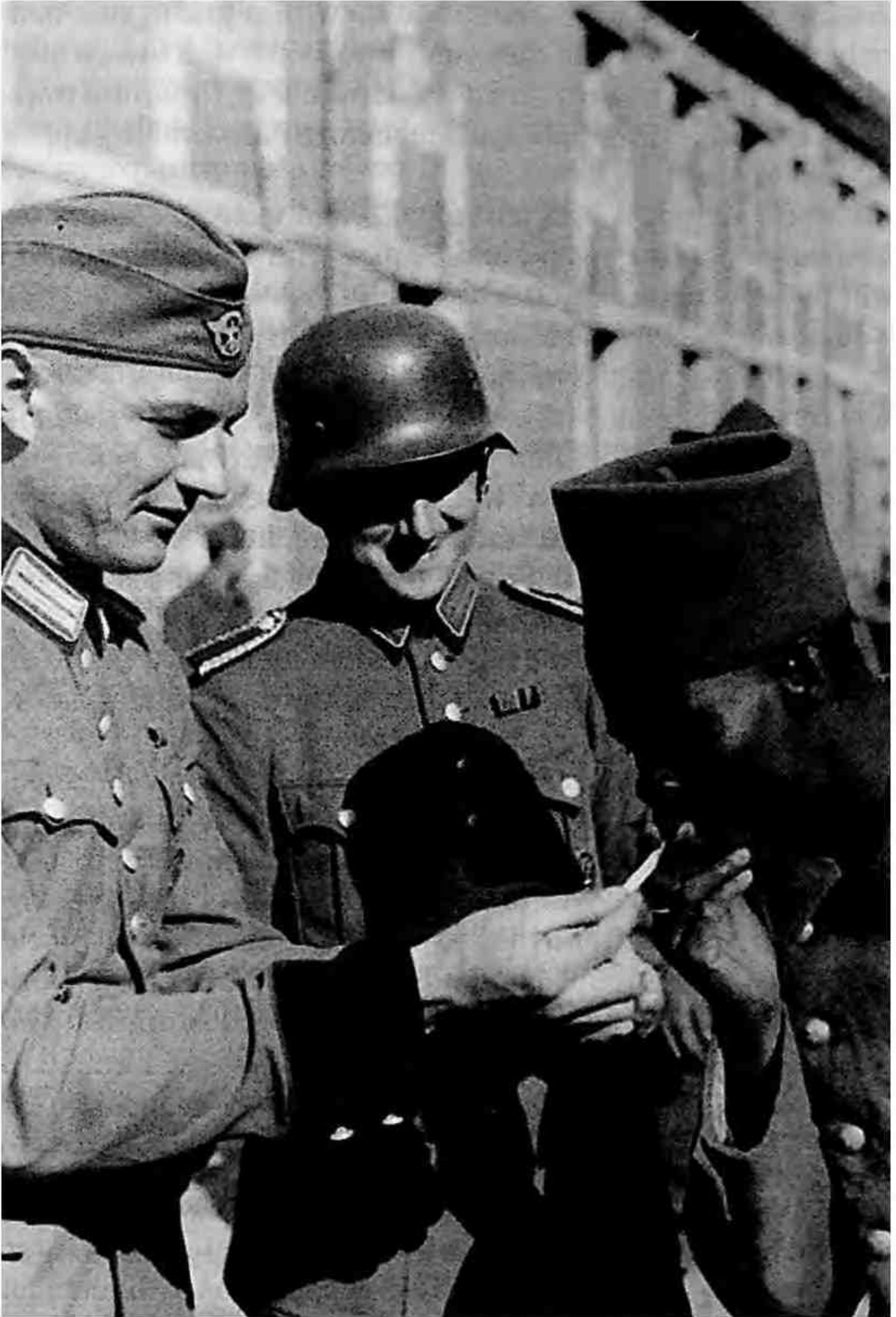
German troops light a cigarette for an African soldier serving with the French army, captured during the Battle for France, 1940.