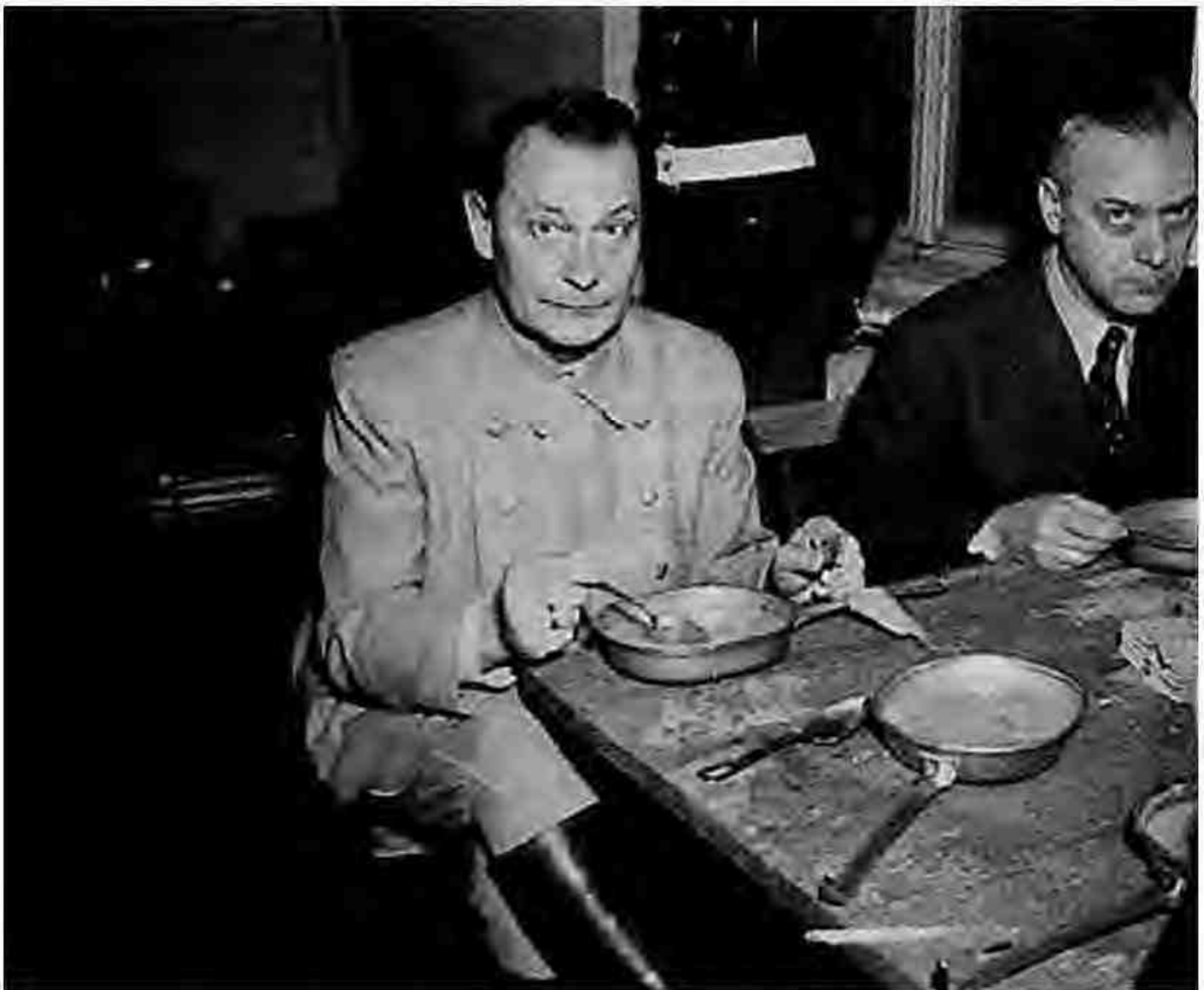
Göring and Alfred Rosenberg, Reich Ministry for the Occupied Eastern Territories, at Nuremberg.

This, your historic goal denies you the office of a judge over the avoidable and unavoidable consequences caused by your