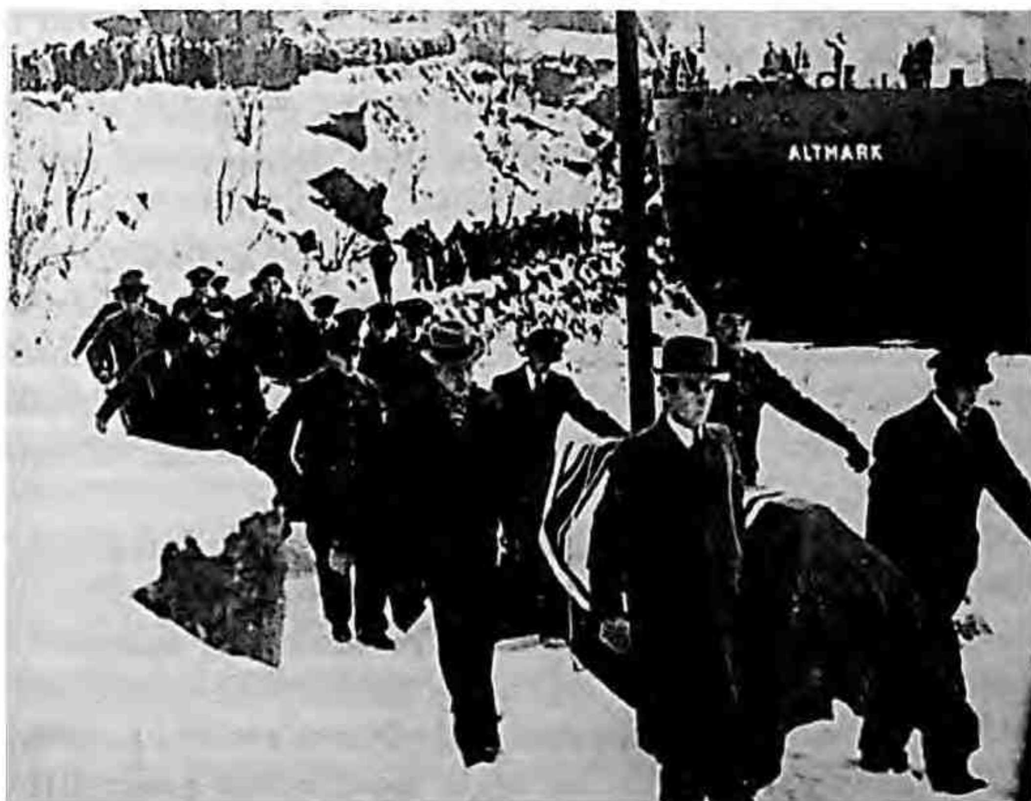
German dead from the Altmark are brought ashore for burial after the incident.