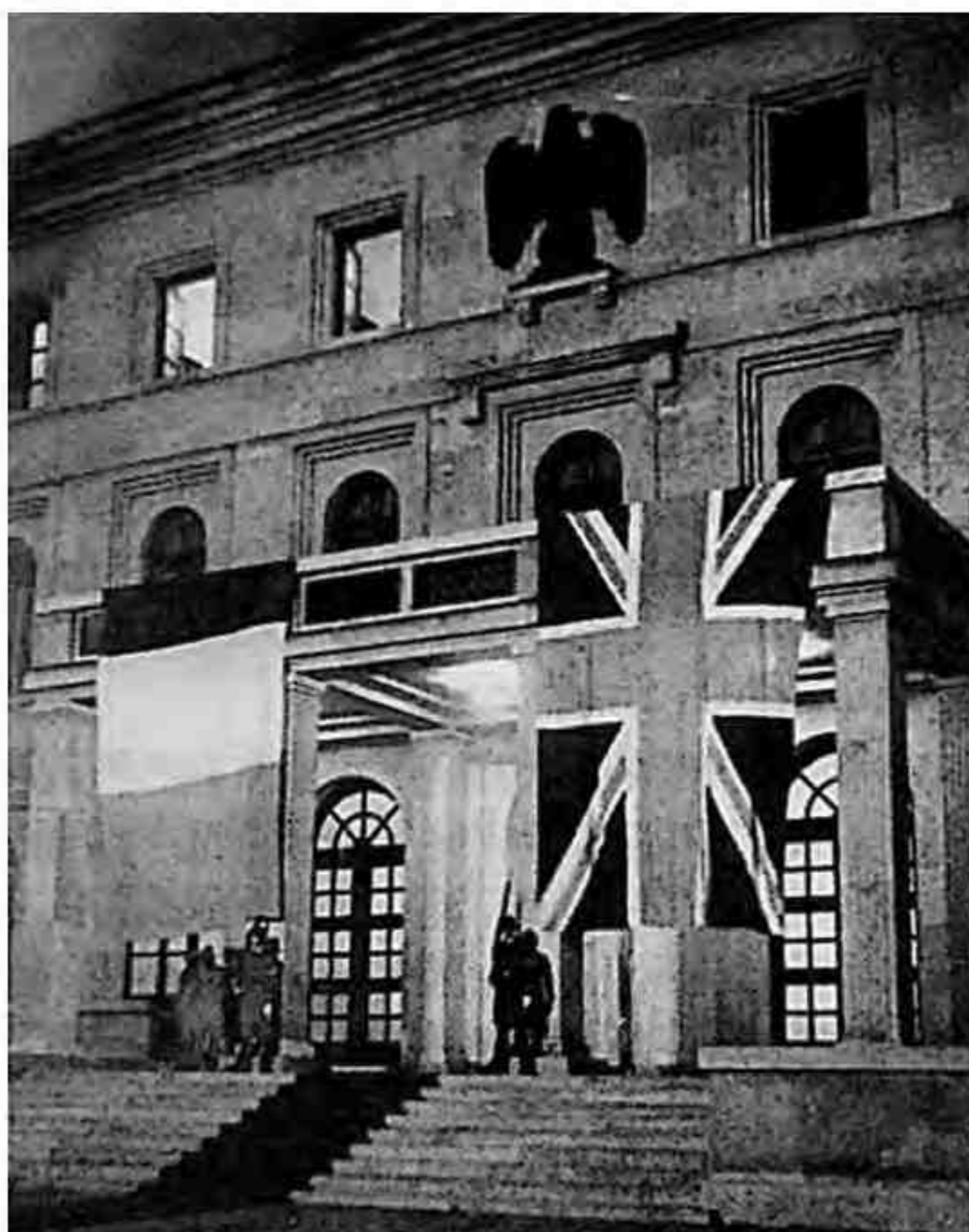
The Führerbau in Munich, decked out with the French and British flags for the 1938 conference.