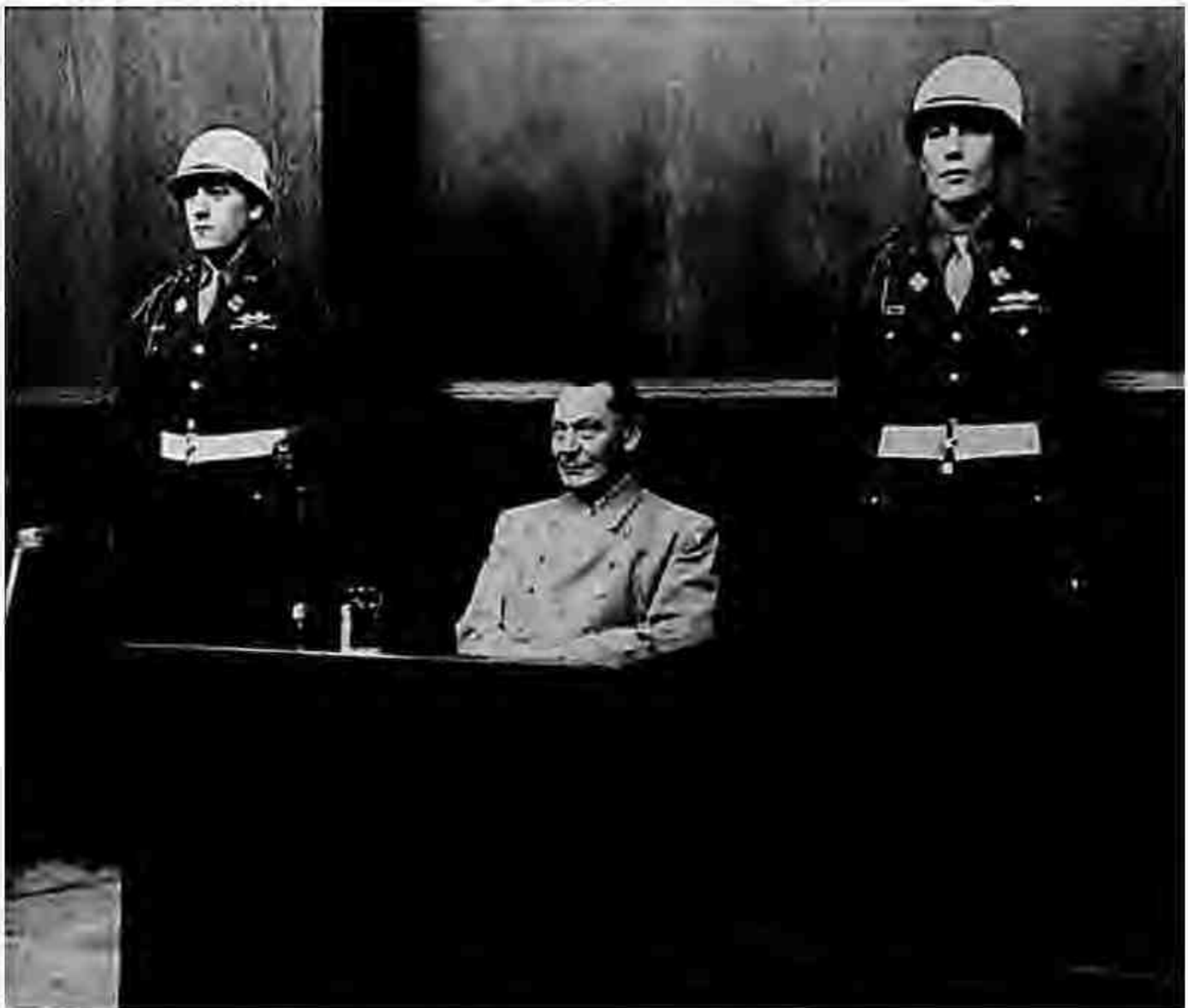
Hermann Göring addresses the Nuremberg Court.

You believe it very clever to have submitted this historic truth to the craftiness to a handful of ambitious junior lawyers in