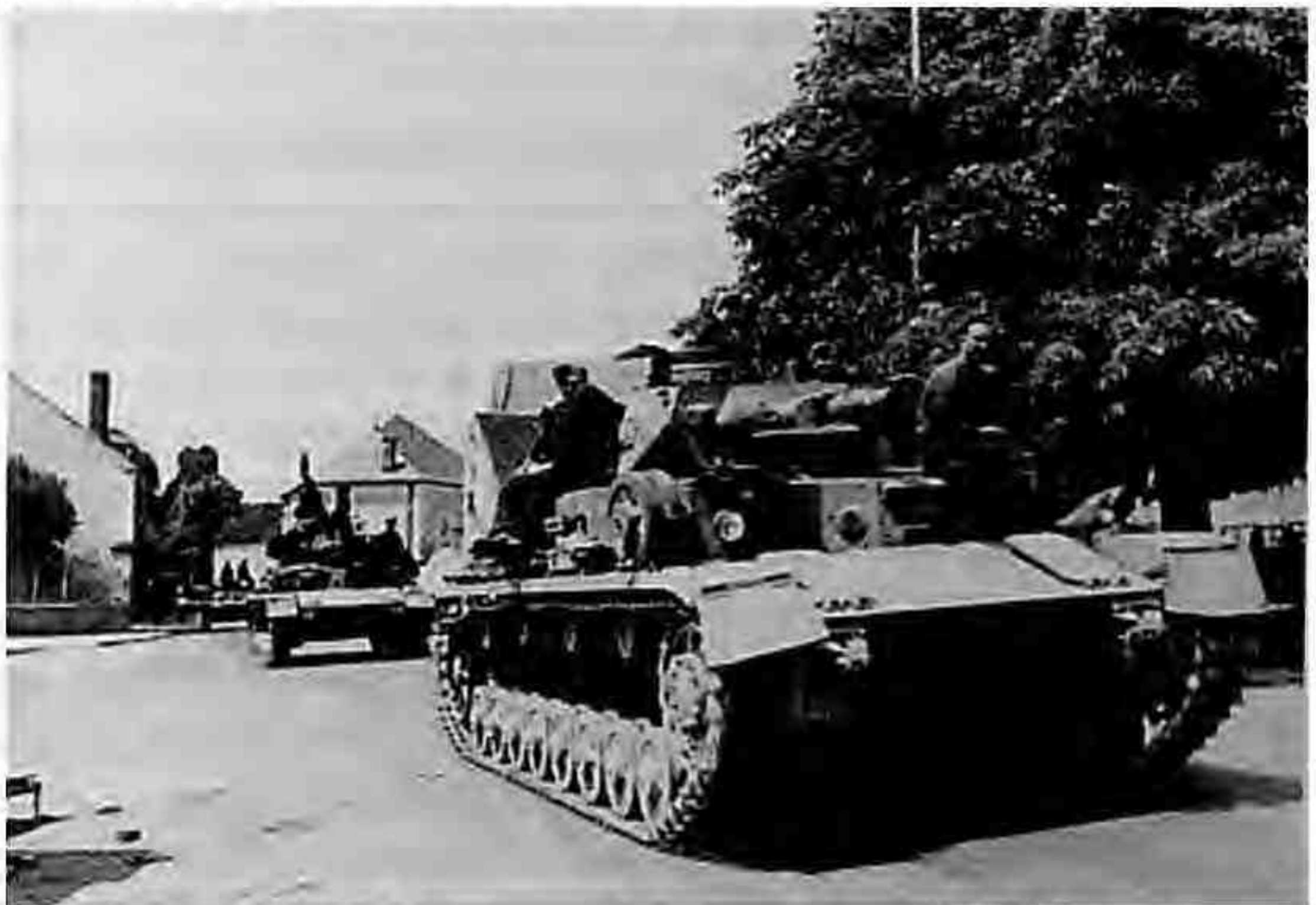
German tanks sweep through France, May 1940.

News of ongoing talks at the general staff-level, also shed a peculiar light on Belgian-Dutch neutrality. I need not emphasize