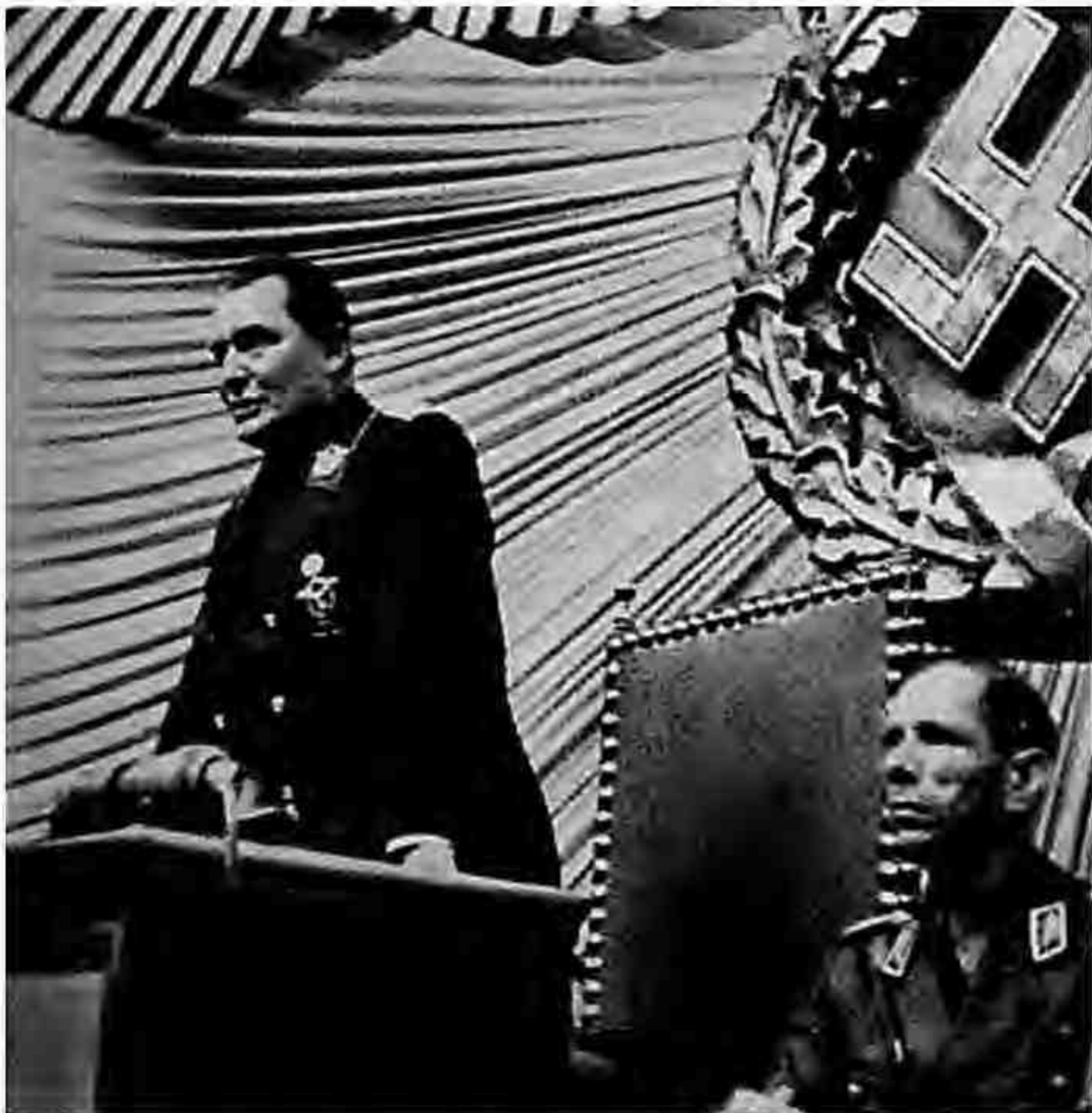
Hermann Göring as president of the Reichstag.

Field Marshal Göring as creator of the German Luftwaffe, and as an individual man, has made the greatest contribution to