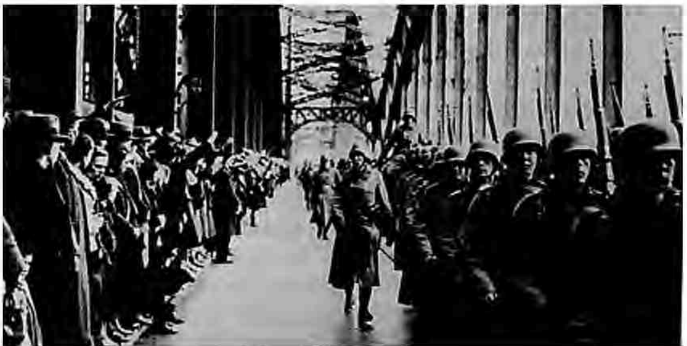
German troops cross the Rhine, 1936.

5. The German Government proposes the setting up of a commission composed of the two guarantor Powers, Britain and Italy, and a disinterested third