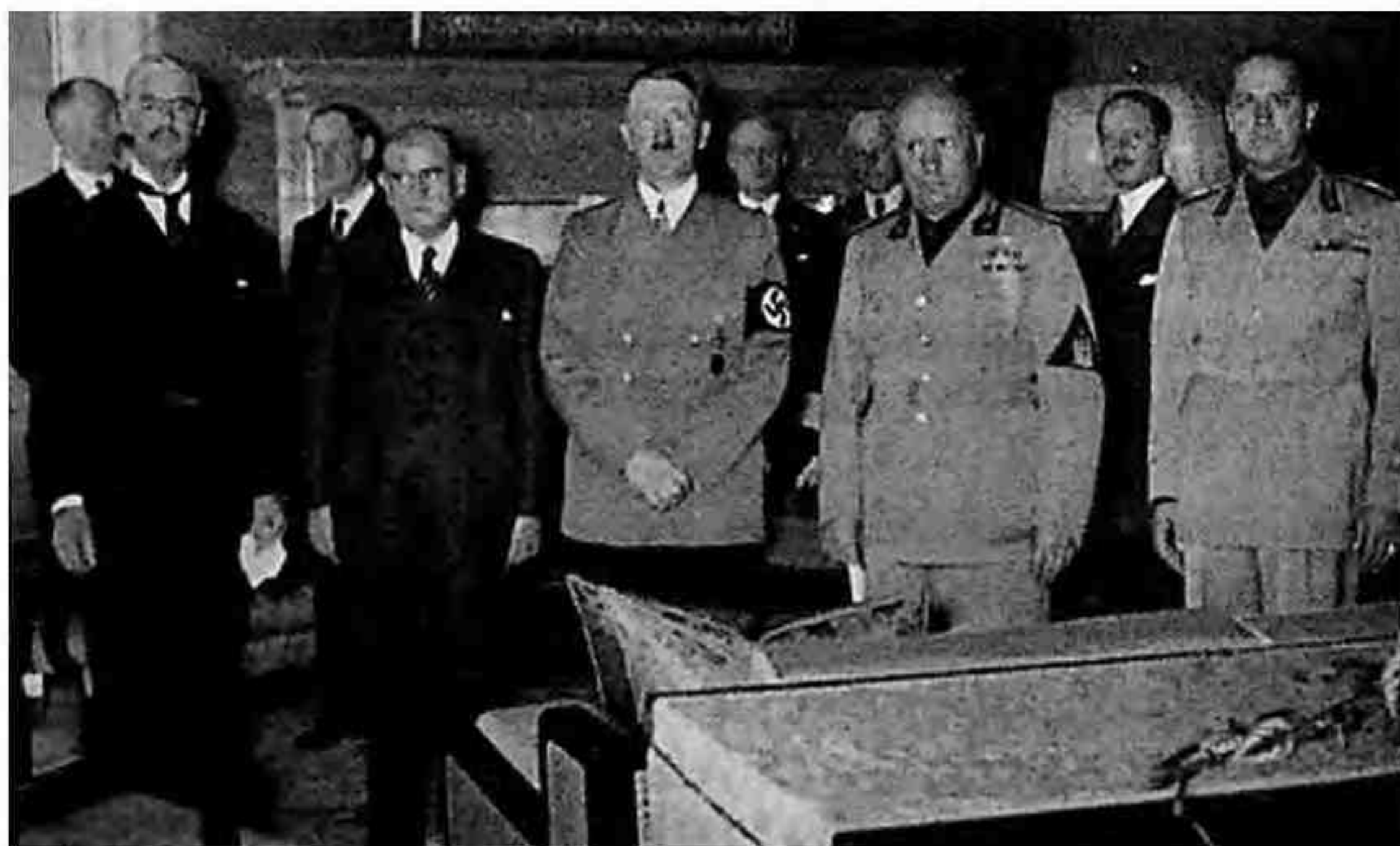
From left to right: Chamberlain, Daladier, Hitler, Mussolini, and Ciano pictured before signing the Munich Agreement.