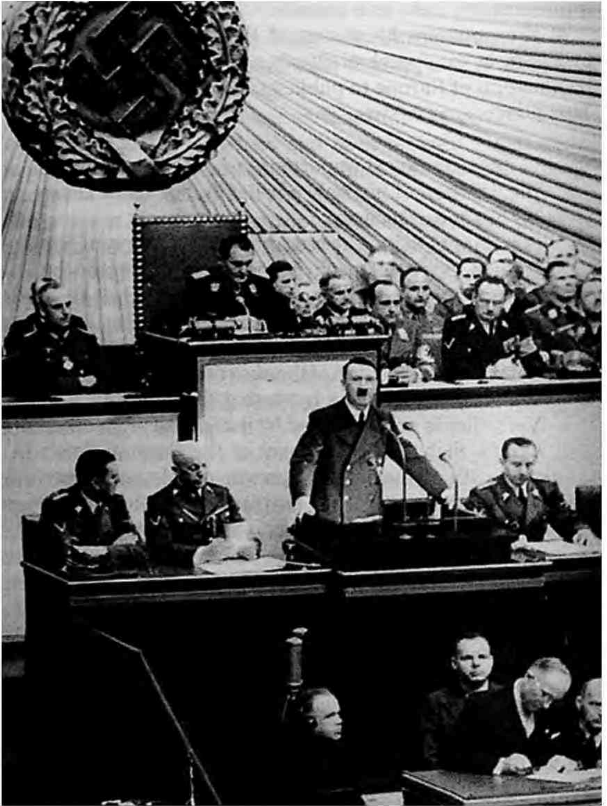
Adolf Hitler spells out a plan for peace in Europe, October 6, 1939.