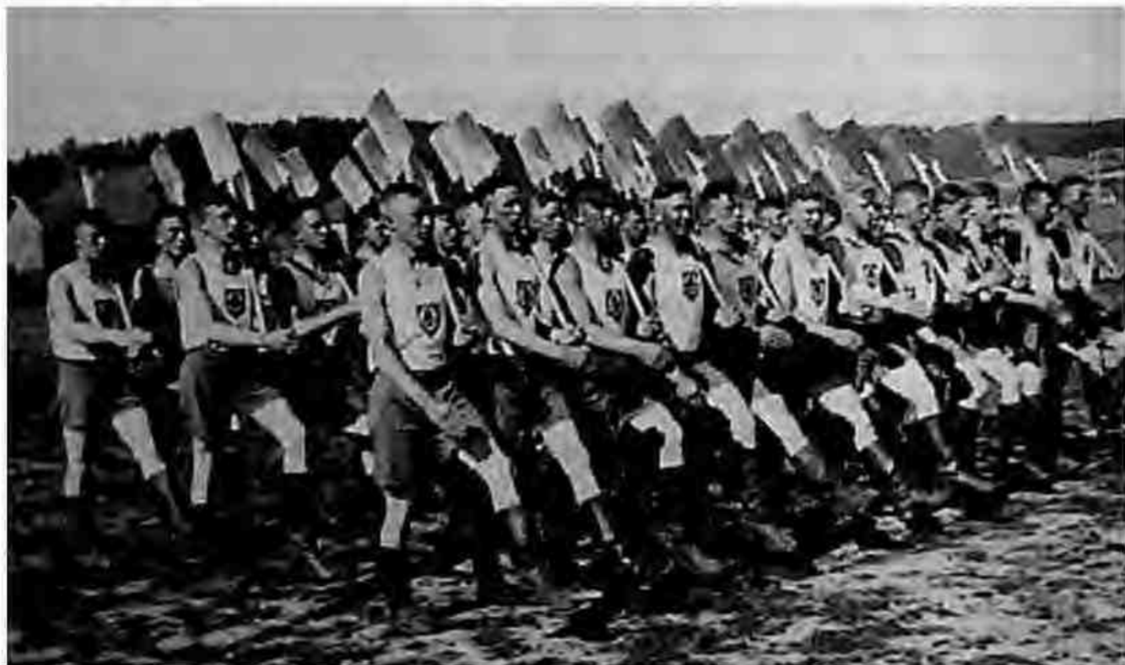
A platoon from the Reicharbeitsdienst, 1940.

The Commander of the Parachute Troops, General der Flieger Student, was severely wounded. The further conduct of