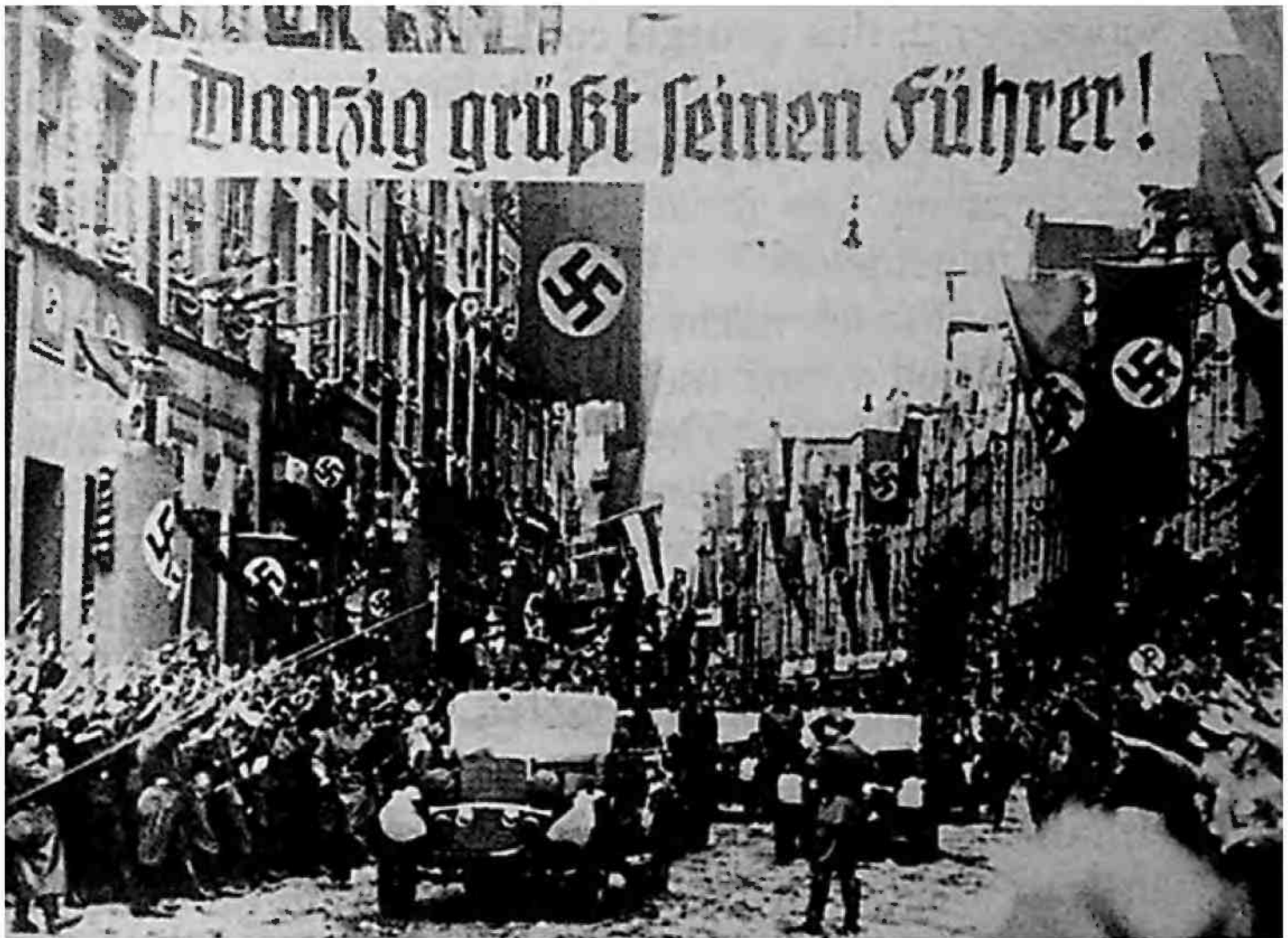
“Danzig greets its Führer!” reads this banner. Danzig, September 19, 1939

If Mr. Churchill or any other warmongers had but a fraction of the sense of responsibility I felt toward Europe, they could not have played so perfidious a game.